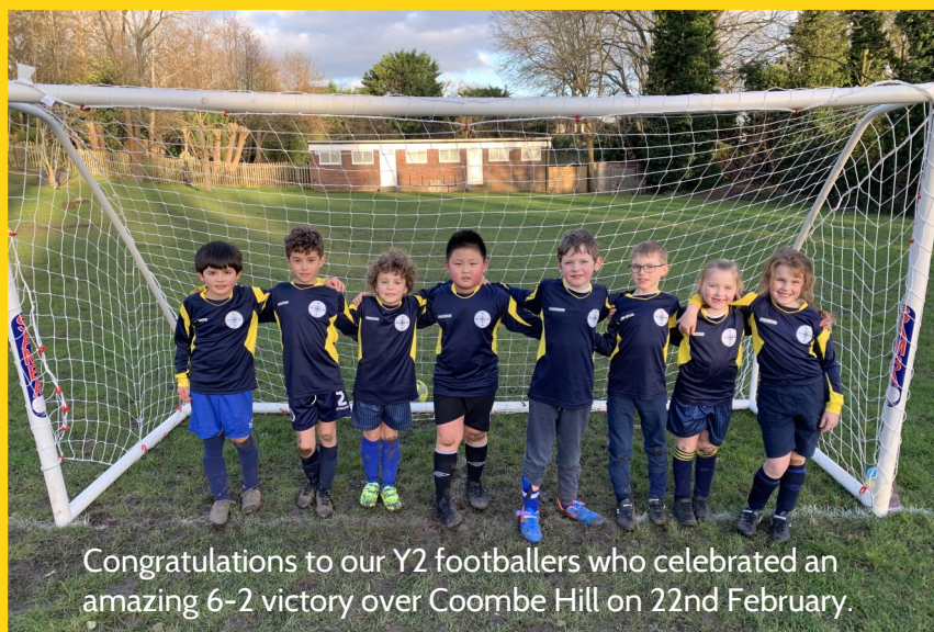
Congratulations to our Y2 footballers who celebrated an amazing 6-2 victory over Coombe Hill on 22nd February.

Tiger class enjoyed reading in the library with their friends.